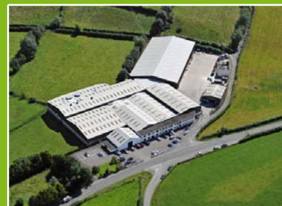
Production facilities of 500,000 sq ft located across 40 acres in Co.Antrim and Co.Tyrone. Left: Steeple, Top Right: Greystone Rd, Bottom Right: Benburb

Units 4-7 Steeple Road Industrial Estate, Antrim, Northern Ireland, BT41 1AB